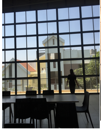
The view in our dining hall in Bangalore!