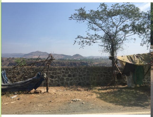
This is somewhere on the way to the Red Light District in Mumbai; we got stuck in a lot of traffic, which provided plenty of time to enjoy the scenery!