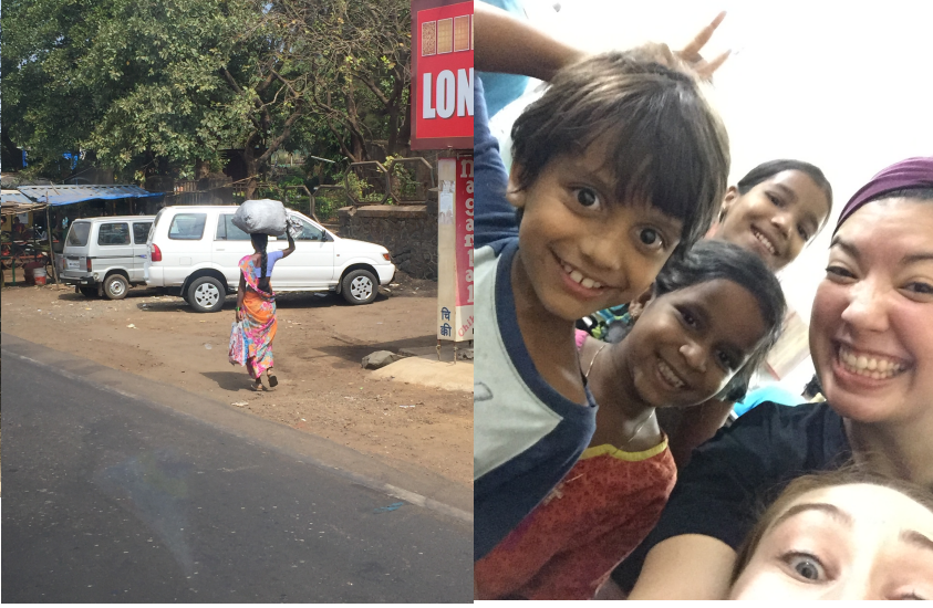
It's uncommon to see a woman balancing something twice her size on her head, sometimes without her hands!