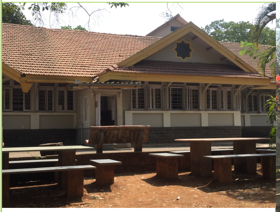
This is the dining hall on the YWAM base in Lonavala, the first place we stayed.