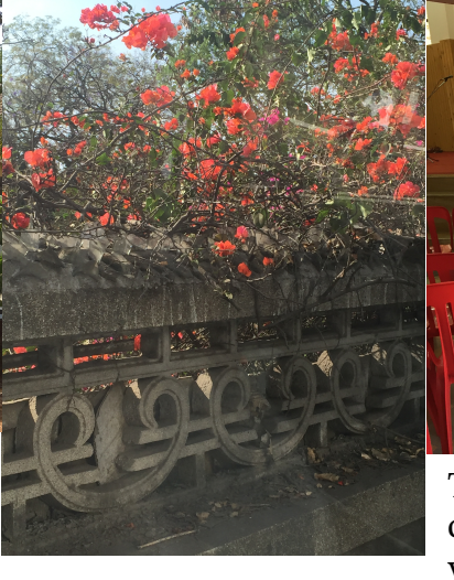
The colors in India are vibrant!