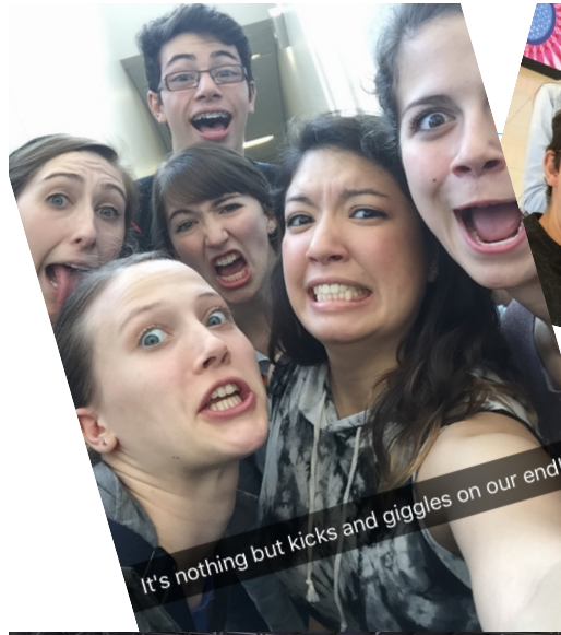
It's nothing but kicks and giggles on our end!